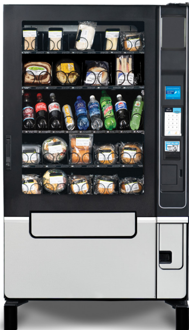
Shown with 7" Touch Screen Option