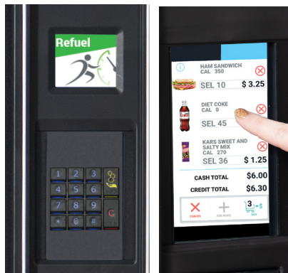
Braille Keypad Standard