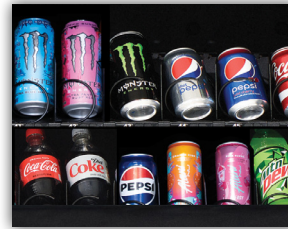
Place carbonated drinks on the bottom 2 trays