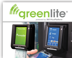
Credit/Debit & Mobile Reader