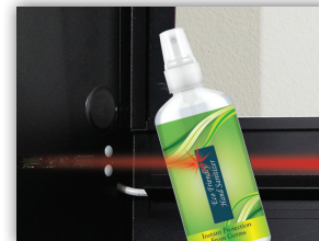
iVend® Guaranteed Delivery System Keeps customers satisfied and reduces service calls for misloaded product.