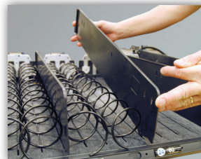
Re-configure trays to almost any package size in the field with no need for tools.