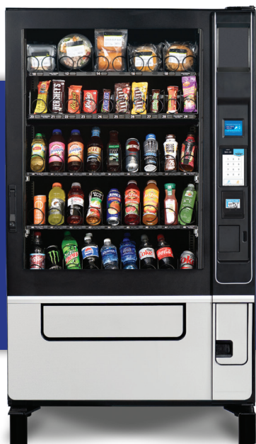
Shown with 7" Touch Screen Option