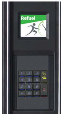
Braille Keypad Standard