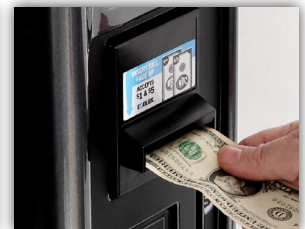
Premium Currency Acceptors Includes standard electronic coin acceptor and $1, $5, $10 & $20 bill acceptor. (Set for $1 & $5).