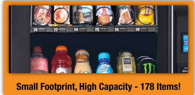
Small Footprint, High Capacity - 178 Items!