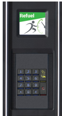
Braille Keypad Standard