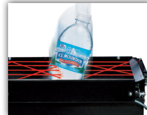
iVend® Guaranteed Delivery System Keeps customers satisfied and reduces service calls for misloaded product.