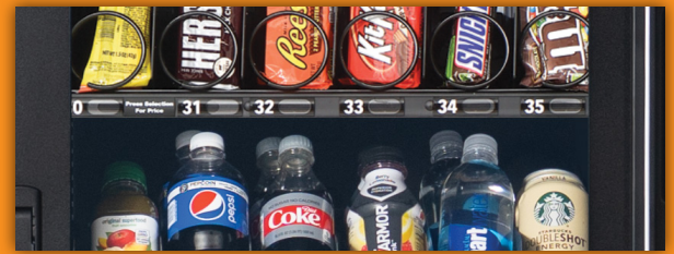
Small Foot Print High Capacity - 234 Items!