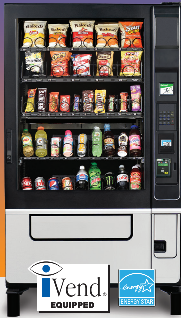
Evolution Combo SZ 38 Glass Front Can, Bottle & Snack 72" x 41.2"W x 38"D, *Ship Weight 811 lbs 38 Selections Capacity: 376 Items (100 snacks, 168 Candy & 108 Drinks) Optional Card Reader Available