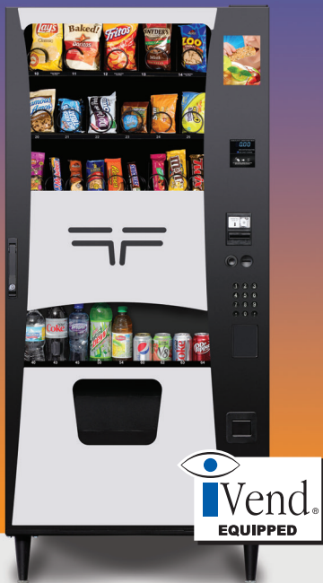
29 Select SV 9/20 Drink and Snack Combo 74.5" x 34.5"W x 31.3"D, *Ship Weight 621 lbs 29 Selections Capacity: 217 Snack /136 Beverage