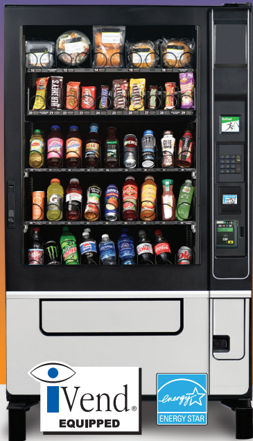
Evolution Combo SZ42 Glass Front Can, Bottle & Food 72" x 41.2"W x 38"D, *Ship Weight 811 lbs 42 Selections Capacity: 280 items (118 Food & 162 Drinks) Optional Card Reader Available