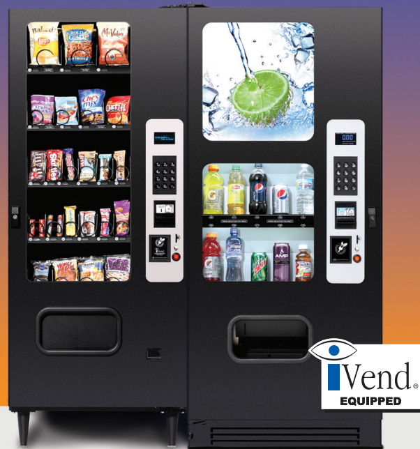
23/10 Combo 23 Select Snack & 10 Select Cold Drink Our Most Popular Combination! Perfect for locations serving 40-75 customers.