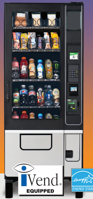
Evolution Combo SZ27 Glass Front Can, Bottle and Food 72" x 29.5"W x 38"D, *Ship Weight 691 lbs 27 Selections Capacity: 178 Items (70 Food & 108 Drinks) Optional Card Reader Available