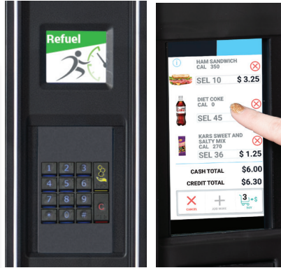
Braille Keypad Standard 7" Touch Screen Option