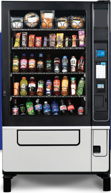
Shown with 7" Touch Screen Option