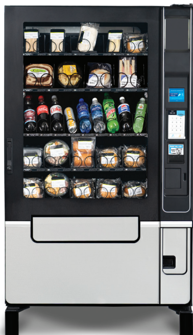
Shown with 7" Touch Screen Option